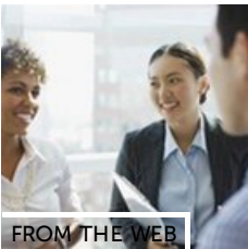
Do Staff Meetings Help or Hurt? XEROX