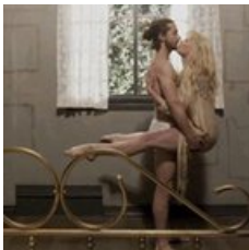
Shia LaBeouf In The Buff For Sigur Rós's Experimental New Video CO.CREATE