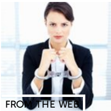
15 Things You Should Never Do at Your Desk SALARY.COM